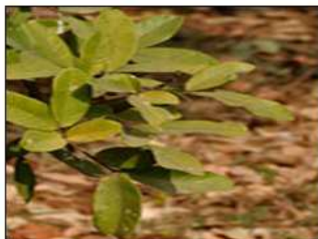
Figure.1(a) Leaves of L.tetraphylla

these folk remedies have not been subjected to extensive scientific scrutiny.