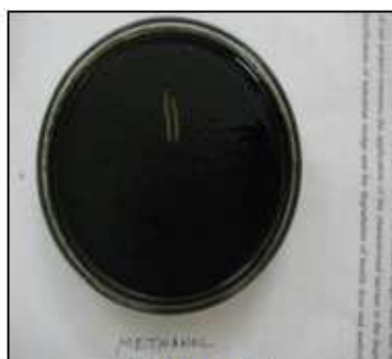
Figure.1(b) Methanolic leaf extract of L.tetraphylla